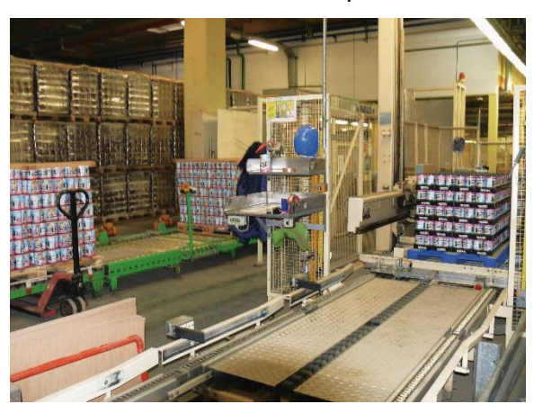
The Nestlé factory in Mainz uses fully automated production plants. Among other things, around 14,000 tonnes of Nescafé is produced here.